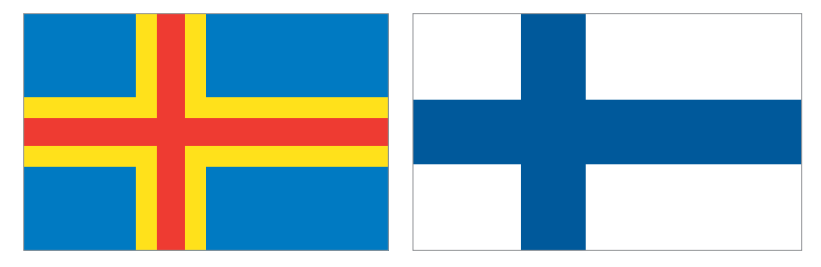
Fig 2. The Flag of the Åland Islands (Left) and the Finnish National Flag (Right)